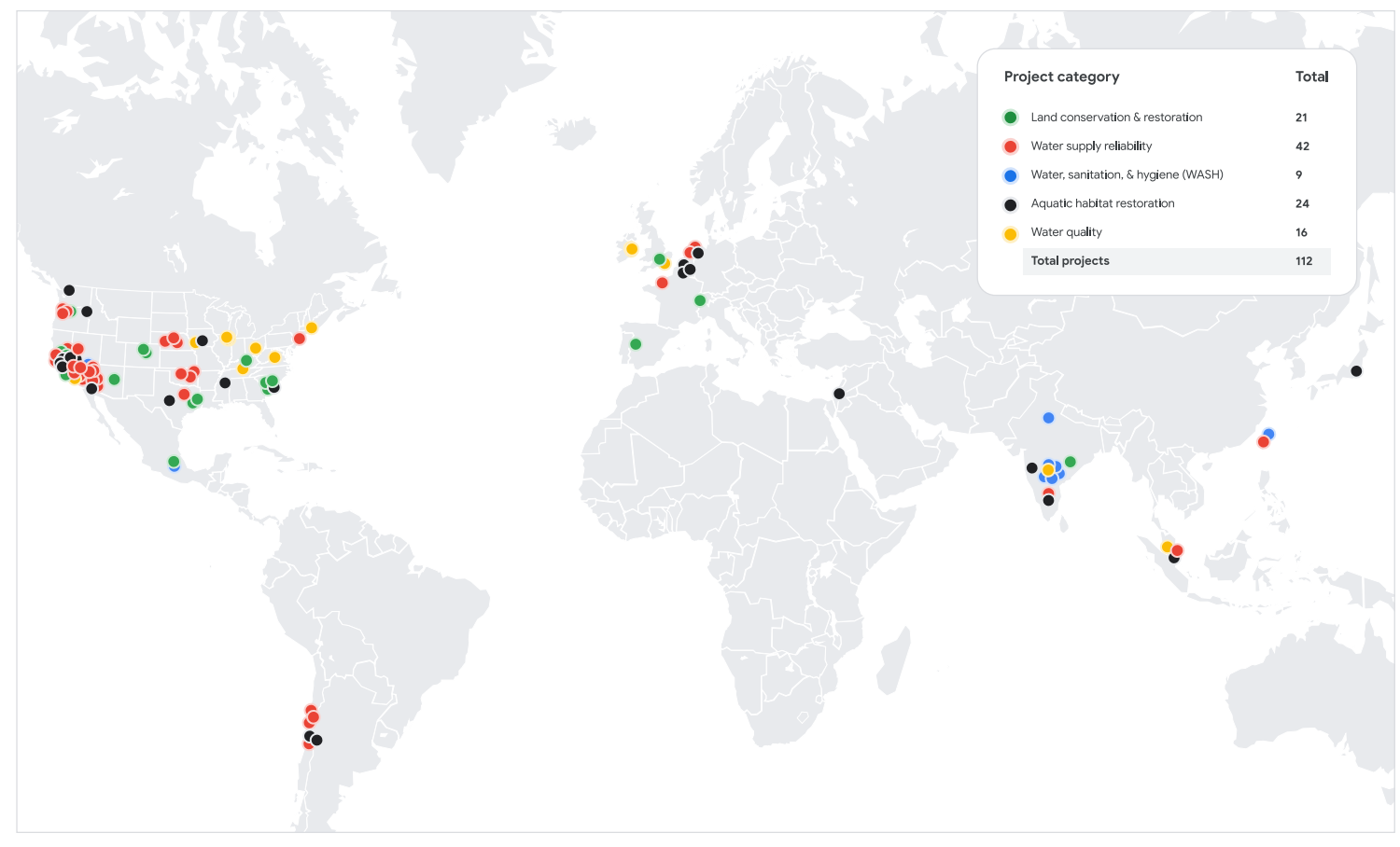
Google's water stewardship project map as of the end of 2024.